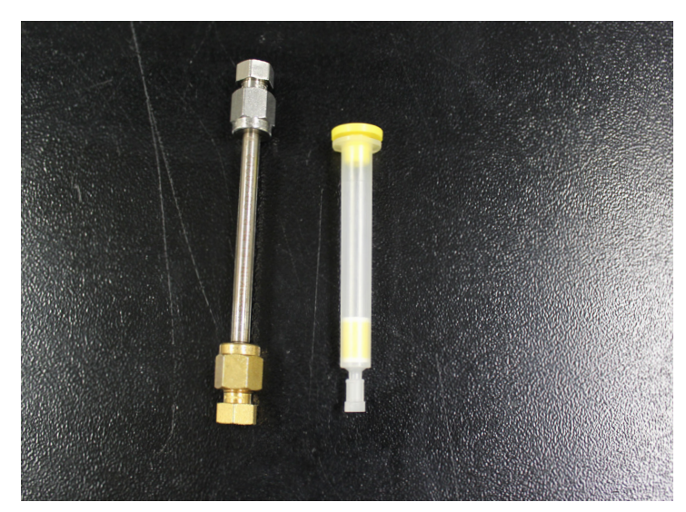
Environmental exposure sampling media for air sampling: Tenax<sup>®</sup> tube (left) and 2,4-dinitrophenylhydrazine (DNPH) cartridge (right) for volatile organic compounds (VOCs) and aldehydes respectively.

For those VOCs detected but not identified by the laboratory spectral database, a general mass spectral library, available from the National Institute of Standards and Technology (NIST), which includes characteristics of more than 75,000 compounds, is used. Mass spectral characteristics are identified, and compounds identified if they showed an 80% match. All VOCs are quantified from multi-point calibration curves prepared using authentic