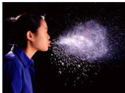
Aerosol cloud of droplets formed when sneezing. (WHO report)

Physical transport can occur by touching surfaces contaminated with the coronavirus and then carrying it to the face, eyes, nose or mouth. This raises the issue of how long the virus can live once it is deposited on a surface. A