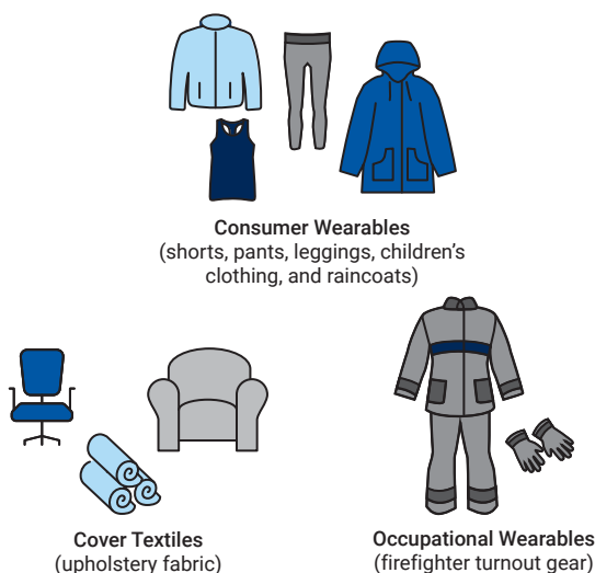
Figure 3: Sources of PFAS in Textiles.

Similar to the liver, the kidneys are also a major reservoir of PFAS due to the extended human half-lives of long-chain or legacy PFAS. 45 Specifically, legacy PFAS such as PFOA and PFOS are concentrated within the kidneys due to active renal tubular reabsorption. Histopathologic, cellular and epigenetic studies have revealed legacy PFAS are highly toxic to the kidneys. 45 Epidemiological evidence supports these findings as legacy PFAS exposure has been associated with reduced kidney function and chronic kidney disease in adults and children. 46,47