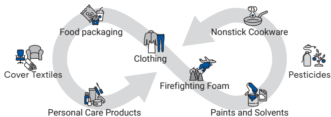
Figure 1: Sources of PFAS.